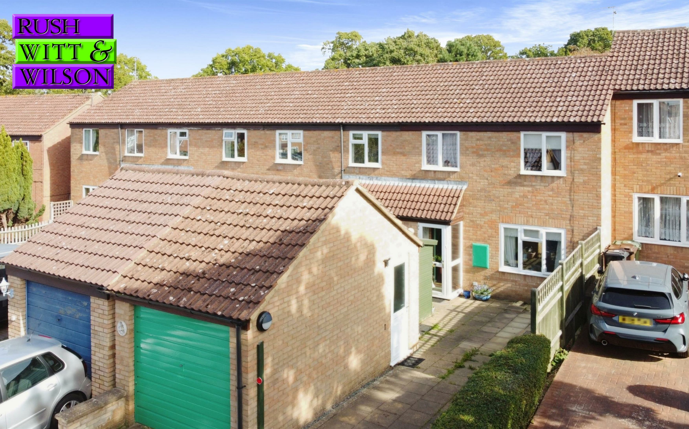
19 Hawkenbury Close, Tunbridge Wells, Kent, TN2 5BL. Guide Price £382,500 Freehold